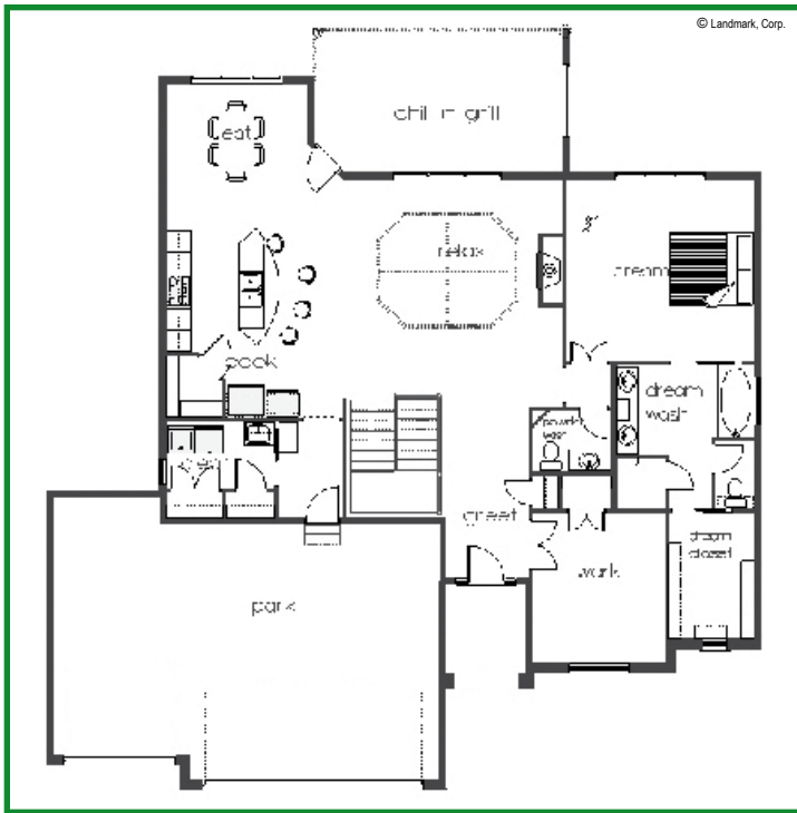
main level (other options available)